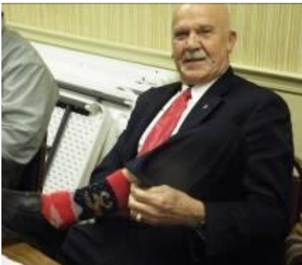
It pays to wear Christmas socks at Monrovia Lions Club.