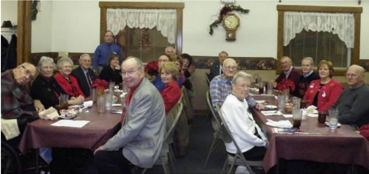
Members of the Bloomfield Lions Club held their annual Christmas Dinner in Odon, Indiana