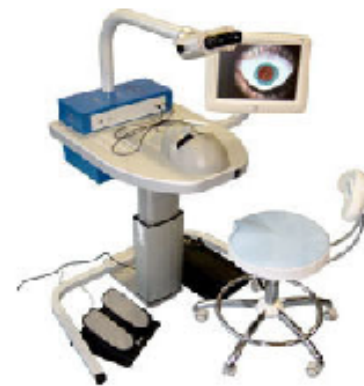
Eyesi Surgical simulator

Since 1959, the ILEBI and the Lions of Indiana have donated over US $477,000 to the Department of Ophthalmology through various grants and fellowships.